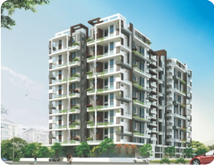
JYOTHI COSMOS Hitech City, Opp. Tech Mahindra