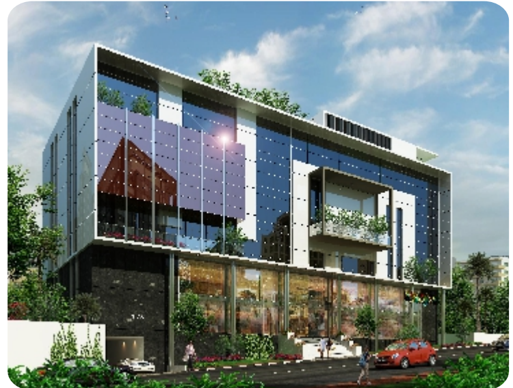
JYOTHI TITAN Near GVK, Banjara Hills, Road No. 1