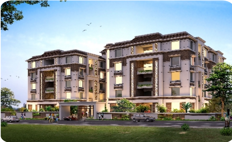
JYOTHI SARADA NEST Banjara Hills, Road No. 2